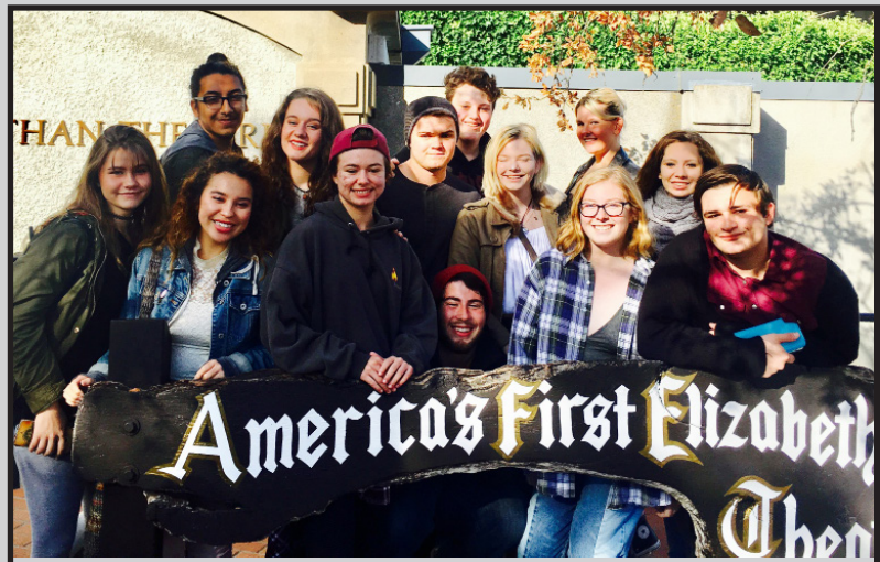
Seniors at Ashland 2017