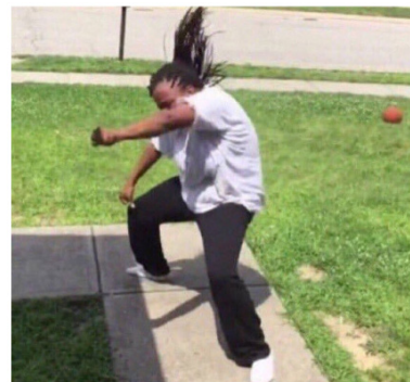
Man Violently Whipping Due to Possession of the Aux Cord