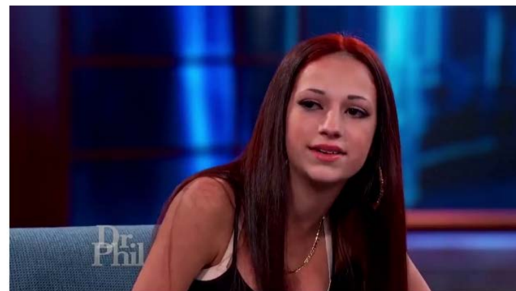
CASSH ME OWSIDE HOWBOW DAH!