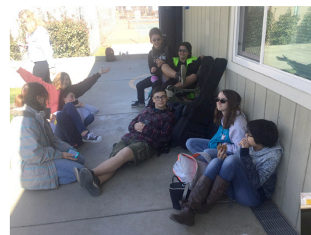
Where's your lunch bunch?