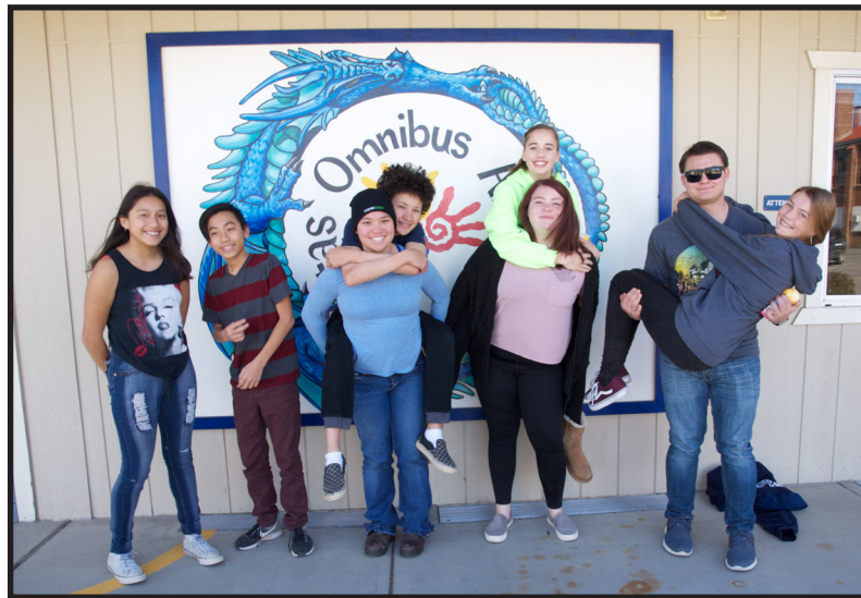
Here are just a few of the many students that have siblings attending MCAA.